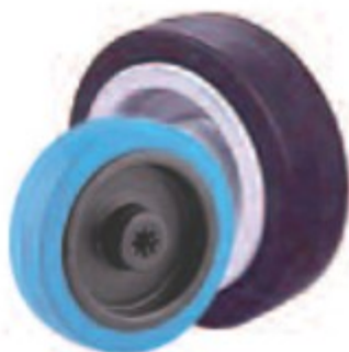
UER Series Blue / Grey Elastic rubber tyre with black nylon centre.