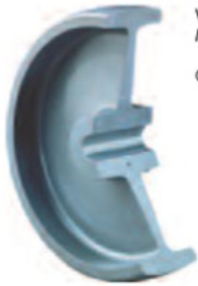
WED Series Medium Duty

Ranges of medium duty polypropylene and heavy duty cast iron wheels suitable for more demanding industrial requirements.