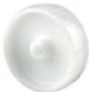
UOO/UOR Series White Nylon Wheel.