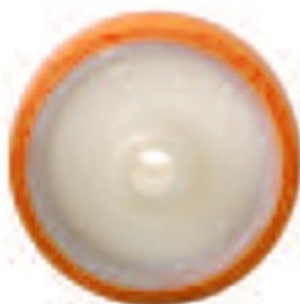
UAO/UAR Series Orange Polyurethane tyre with white nylon centre.