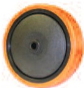
NPB Series Orange Polyurethane tyre with black polypropylene centre.

* Operating temperatures from -20°C to +80°C