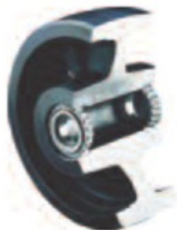
WHC Series Extra Heavy Duty